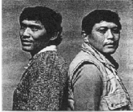
Japanese Nikkei from Peru

2) Comparative Literature and Thought , such as the influence of Asian culture on Latin American literature, philosophy, and film, especially figures like Octavio Paz, Jorge Borges, and Jose Marti, and comparisons of "magical realism" in the respective literary traditions.