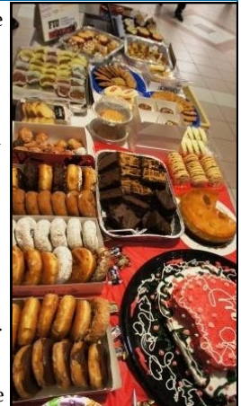
All baked goods were donated for this event.

All events are open to the public. Please see page 6 for upcoming events.