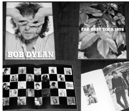
From '78 Far East/Budokan Tour Program

The Japanese people can hear my heart still beating in Kyoto at the Zen Rock Garden – Someday I will be back to reclaim it.