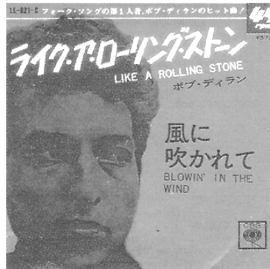
Dylan '60s Record Jacket in Japan

Dylan’s possible interest in a Zen outlook was no doubt greatly enhanced by his travels in Japan a decade later. Dylan’s music gained popularity and a cult following in Japan beginning in the '60s when songs like “Blowin’ in the Wind” and “Like a Rolling Stone” were hit singles, and he became a role model for Japan’s student protest movement during the Vietnam War era.