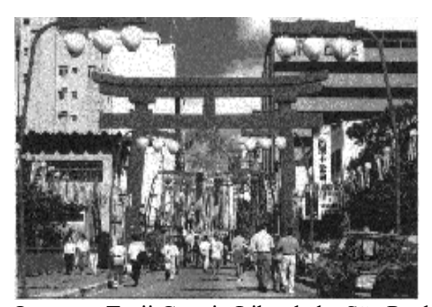
Japanese Torii Gate in Liberdade, São Paulo

1) Ethnic Identity, including the function of the Japanese communities in Brazil and Peru and the Chinese in Cuba and Panama, as well as Japanese-Latin Americans ( Nikkei ) returning to the homeland as laborers ( dekasegi ).