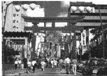
Japanese Torii Gate in Liberdade, São Paulo