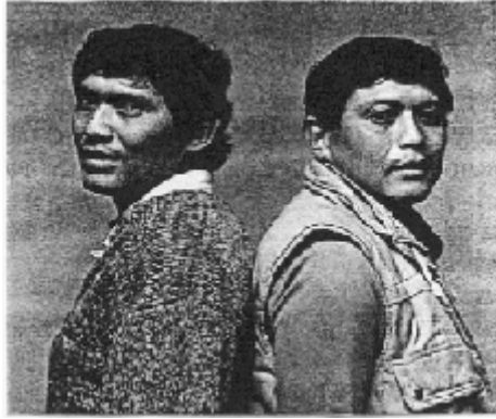
Japanese Nikkei from Peru

2) Comparative Literature and Thought , such as the influence of Asian culture on Latin American literature, philosophy, and film, especially figures like Octavio Paz, Jorge Borges, and Jose Marti, and comparisons of "magical realism" in the respective literary traditions.